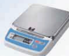
Stainless Steel Pan (optional)

Options Stainless steel pan (HT-10) AC adaptor