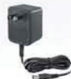
AC Adaptor (optional)